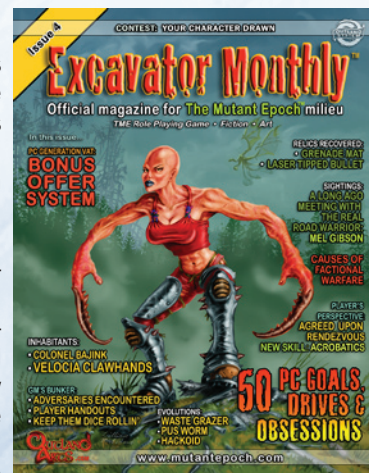
Cover of EM issue 4

Issue 6 starts off with a GM's Bunker article about player controlled NPCs, followed by a massive PC Generation Vat feature on Stereotypes and Character Generation. PC stereotypes allow players to take on the rolls of various pre-devastation iconic personas or cliches, inspired by either old world media or some