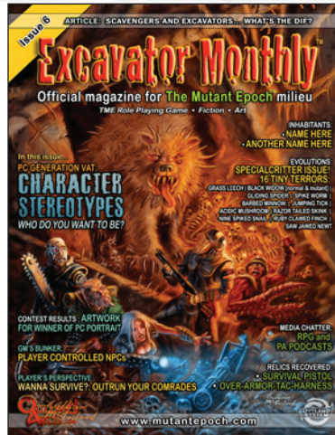
Cover of EM issue 6

The best twenty photos will be posted on our web site, while of these, the finest will also be included in issue 1 or 2 of Excavator Quarterly, the evolved, more robust, mutated descendant of Excavator Monthly Magazine. Plus, the winner will get a free copy of MQ issue 1 as well as a PDF copy of Pitford, Gateway to the Ruins as soon as it released, mailed to you at the address specified with your entry. Judging the contest will be a group of 8 creatives including writers, illustrators, photographers and designers.