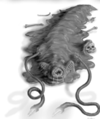
Red Harvester Page 9