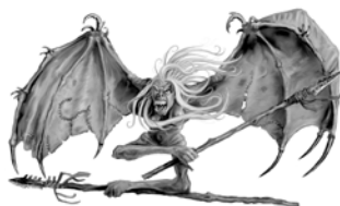
Muto Harpy Page 80