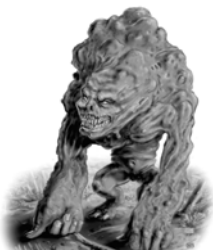
Rubble Troll Page 92