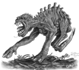
Sickle Foot Page 5