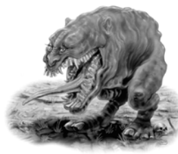
Walking Mouter Page 84