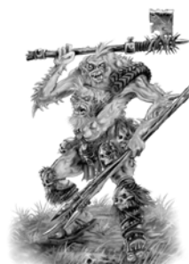
Chest Head Page 65