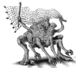
Junk-Mobster Page 19