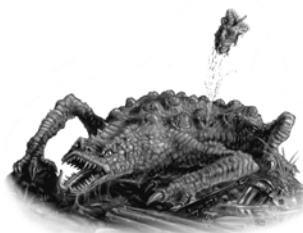
Back Hatcher Page 37