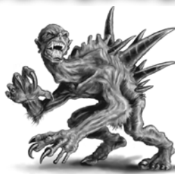
Spikeback Page 14