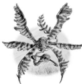
Apocalypse Moth Page 116