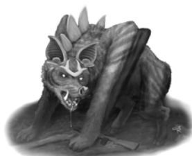
Wailing Jhonny Page 51