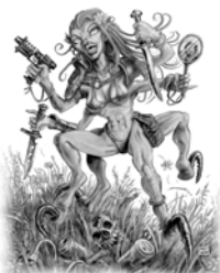
Talontessa Page 70