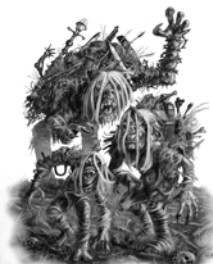
Scraplurker Page 30