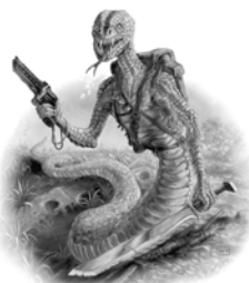
Snaykin Page 101