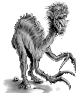
Tyrannosapien Page 56