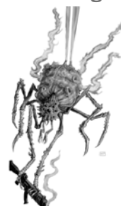
Spider Lord Page 120