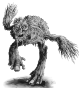
Spiker Page 46