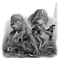
Nubinz Page 108