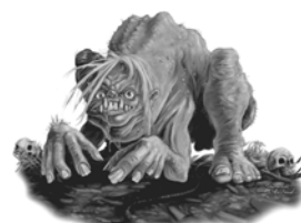
Quasi Page 43