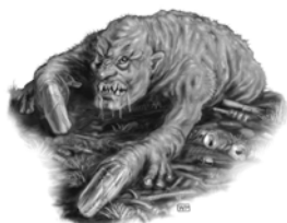
Bog-Billy Page 25